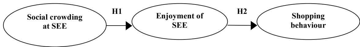
Figure 1.1: A conceptual model of the effect of social crowding on consumer enjoyment of SEE